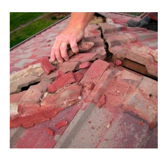
REMOVE RIDGE CAPPING & DAMAGED BEDDING AS REQUIRED