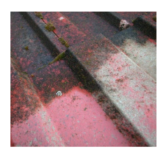
ROOF BEFORE RESTORATON