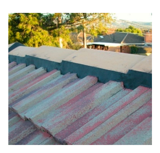
REPAIRS COMPLETE & RINSE OFF ROOF TO REMOVE DUST, READY FOR COATINGS