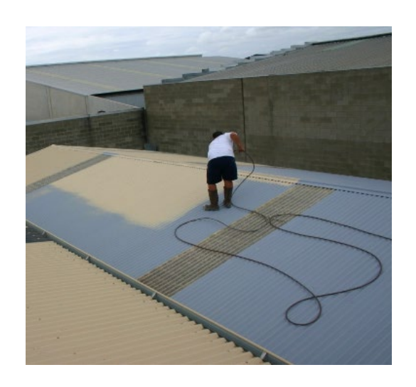
SECOND COAT - CRC MEMBRANE OR SUPA COOL MEMBRANE