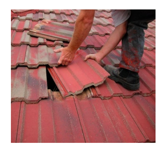
REPLACE BROKEN TILES