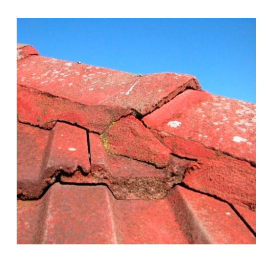
CRACKED & BROKEN POINTING, BEDDING