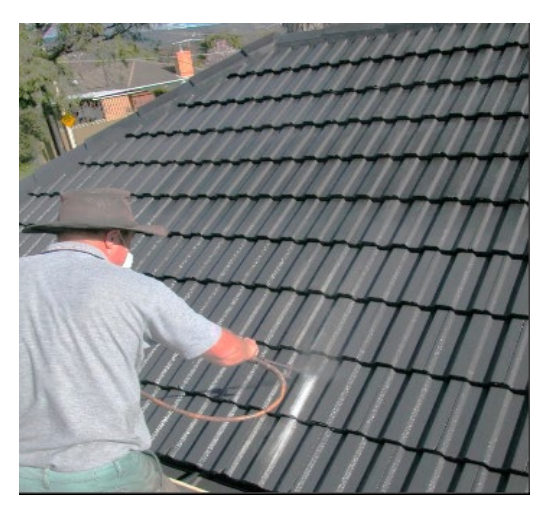
THIRD COAT - CRC MEMBRANE OR SUPA COOL MEMBRANE