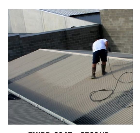
THIRD COAT - SECOND MEMBRANE COAT - CRC OR SUPACOOL