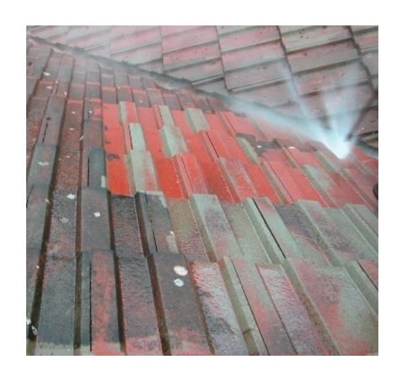
HIGH PRESSURE CLEANING