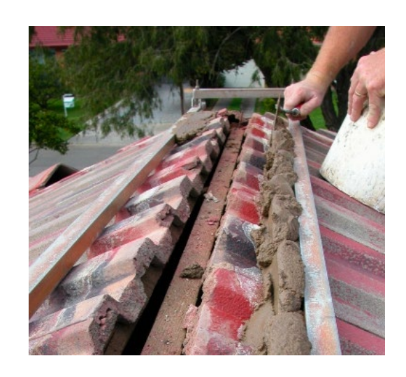
RE BED WITH NEW MORTAR