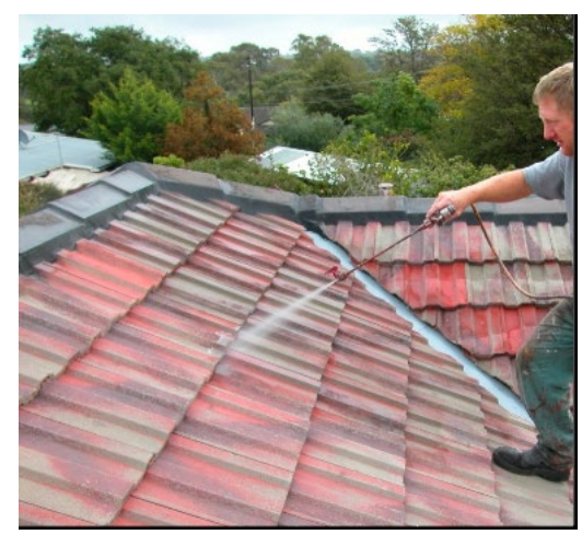
FIRST COAT - ACRYLOC MOULDRID, SLOWS FUTURE MOULD GROWTH