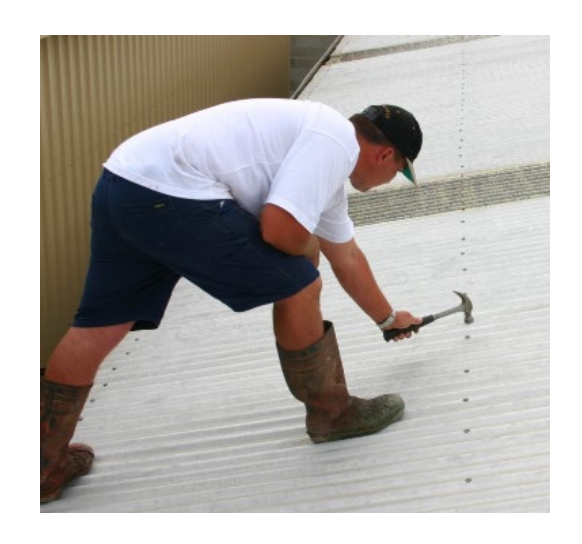
REPLACE DAMAGED SHEETS, FIX LOOSE NAILS OR SCREWS