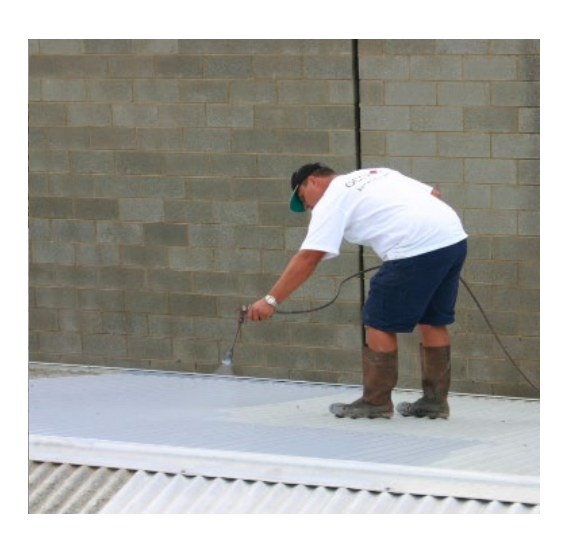
FIRST COAT – ACRYLOC PRIMERBOND METAL & GALV PRIMER. (ROOF RESTORE ON OLD C/BOND)