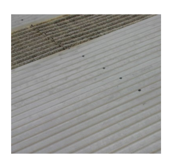
ROOF IS DULL, DIRTY & FADED