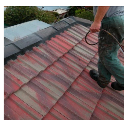
SECOND COAT - ACRYLOC PRIMERBOND ROOF RESTORE, ESSENTIAL FOR ADHESION!