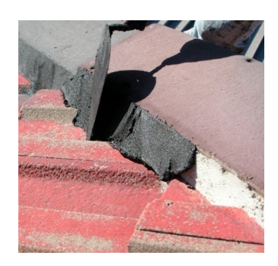
RE POINT WITH FLEXIBLE POINTING