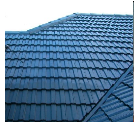
FOURTH COAT -SECOND MEMBRANE COAT -CRC OR SUPACOOL