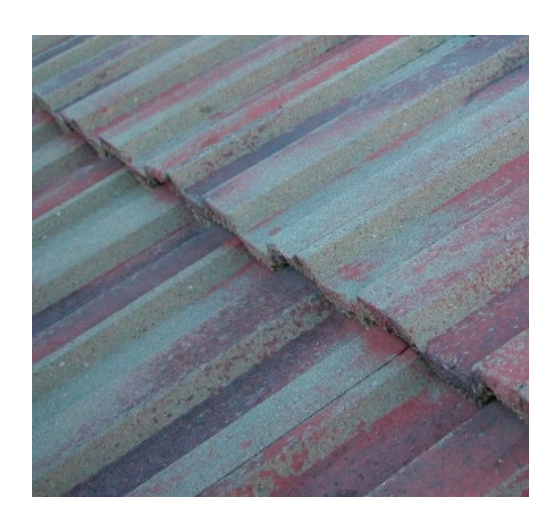
PAINT WILL NOT STICK TO A SURFACE THAT IS DIRTY!